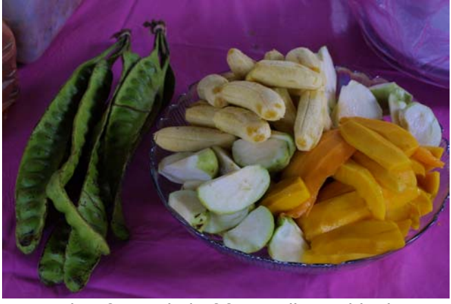
A bat fruit salad of fruit pollinated by bats

At least 31 plant species in Malaysia alone rely on bats for pollination. Some of these plant species are important to people too. Trade in durian in South East Asia is worth about $120 million per year (RM 455 million). In Malaysia, sales of petai just in the Klang Valley come to about $2.8 million per year (RM 10.8 million) - all thanks to bats!