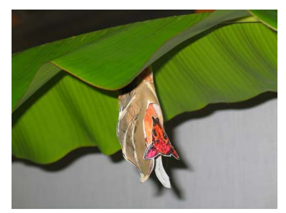
Make a bat from cotton wool