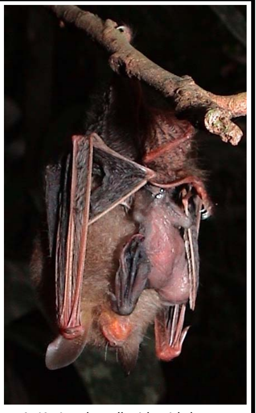
A Kerivoula pellucida with her pup

When she returns, she finds her baby by recognising its voice and smell. She can manage this even if there are hundreds of pups to choose from. In fact, as the pups cluster together for warmth, there may be up to 5000 of them in a square meter.