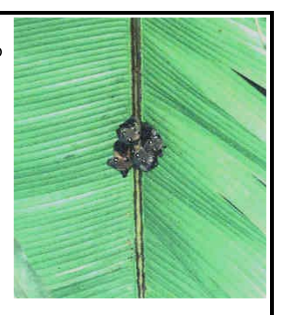
Cynopterus brachyotis roosting under a banana leaf

The tent both hides the bats from visual predators and protects them from rain. It is also thought that males make the tents to attract females.